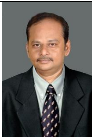
Dr. Nethaji Ramalingam Devaki Amma Memorial College of Pharmacy, Chelembra, Malappuram, Kerala - 673634